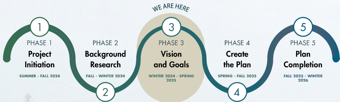
Figure 1. Estimated project phase timeline.

The estimated project phase timeline is shown in Figure 1 . Phase 3: Vision and Goals started in Winter 2024.