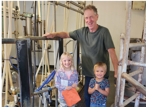
Coleman Meadows Farm photo

Coleman Meadows Farm is a 170-acre farm and home to Canada's most West Coast Water Buffalo and Cow dairies. The Dyson family welcomes you to our friendly herd of grass-fed water buffalo and Jerseys just off the Pacific Rim Hwy. Our farm market is open year-round on Saturdays from 10-2 with a selection of water buffalo products including: cheeses, yogurt, and a full assortment of meats.