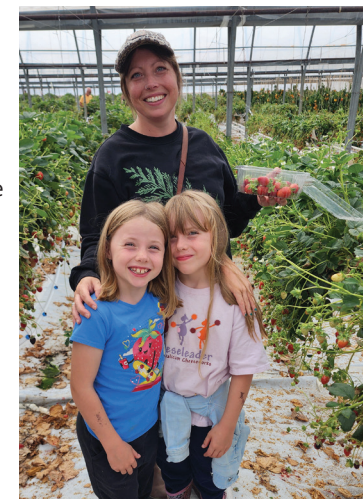
Rage's Farm photo

Simples sells herbs, native and heritage plants and fruits. Simples create vinegars and vinaigrettes and bake delicious bread. We also have various art items – Again this year, we have Tim's hand-made canes and walking sticks! We are a very small urban farm and can be found Saturday mornings, 9 am-noon at the Spirit Square Farmers' Market at the foot of Argyle Street.