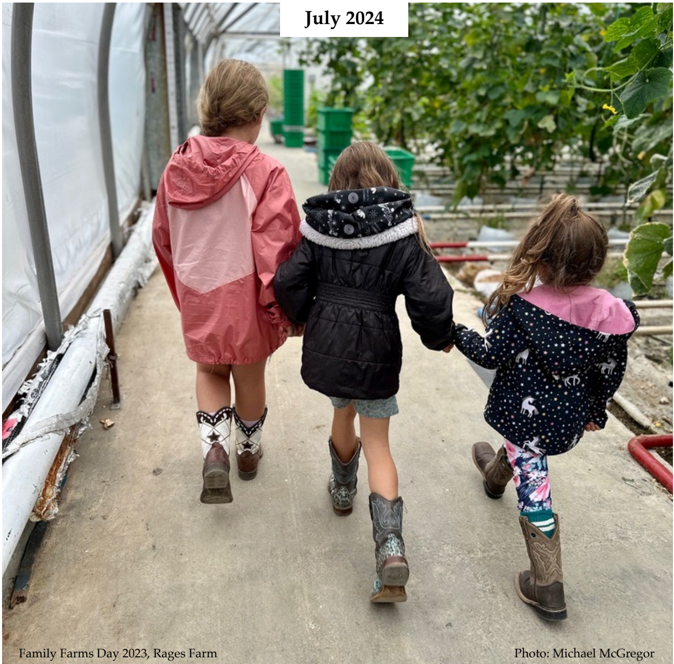
Family Farms Day 2023, Rages Farm