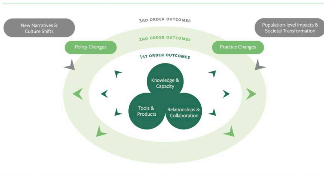
DIAGRAM. Systems Change Outcomes Framework