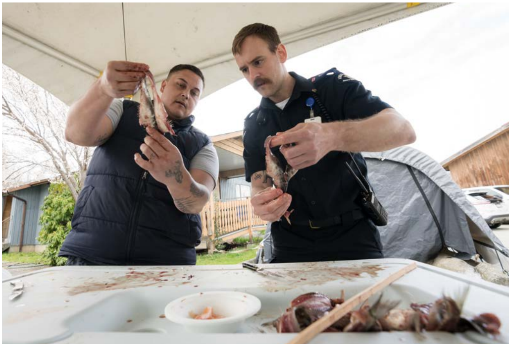
Image 5: Island Indigenous Foods Event 2024

The event featured a focused session on planning for emergency food security and Indigenous food sovereignty. The 'meeting' was embedded within the celebration, and by all reports, a grand success. Planning is in the works for further celebrations in the coming years.