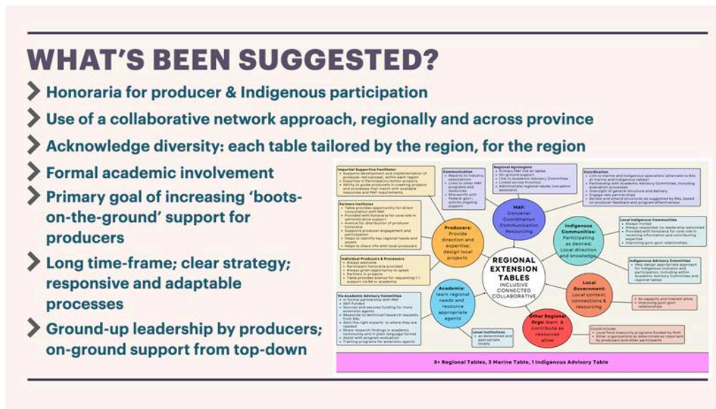
Image 7: From: Extension & Research Event Presentation, Jan 27, 2023