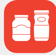
GLASS JARS & CONTAINERS*