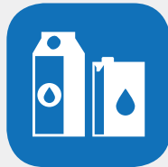
PAPER PACKAGING THAT CONTAINED LIQUIDS