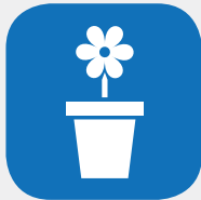
PLASTIC GARDEN PLANT POTS & TRAYS