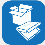
CARDBOARD & BOXBOARD