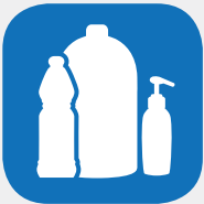
PLASTIC BOTTLES, CONTAINERS & TUBS <25L