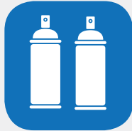
EMPTY AEROSOL CANS NO HAZARDOUS MATERIALS