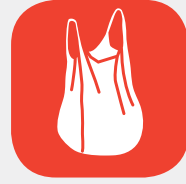
PLASTIC BAGS & OVERWRAP*

These items can be recycled at the 3rd Ave. Recycling Depot or the AV Landfill Recycling Depot