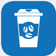
PAPER BEVERAGE CUPS & LIDS