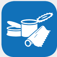
TIN & ALUMINUM CONTAINERS/FOIL