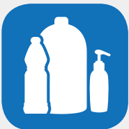
PLASTIC BOTTLES, CONTAINERS & TUBS <25L