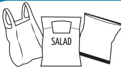
PLASTIC BAGS AND OVERWRAP